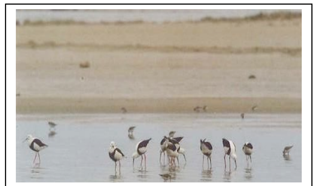
Banded Stilts, The Coorong, March 2005