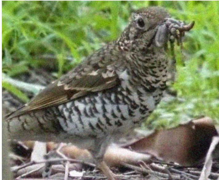
Bassian Thrush carrying worms.

I kept my eyes open, hoping for a photograph. On 6 August I was lucky – a Bassian Thrush crossed the path