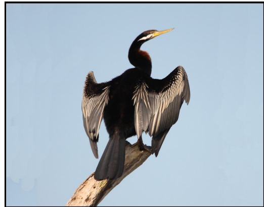
Australasian Darter